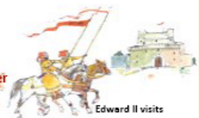
Edward II visits Codnor Castle in 1322

Graphic from "Five Years" episode on Codnor Castle on Channel 4